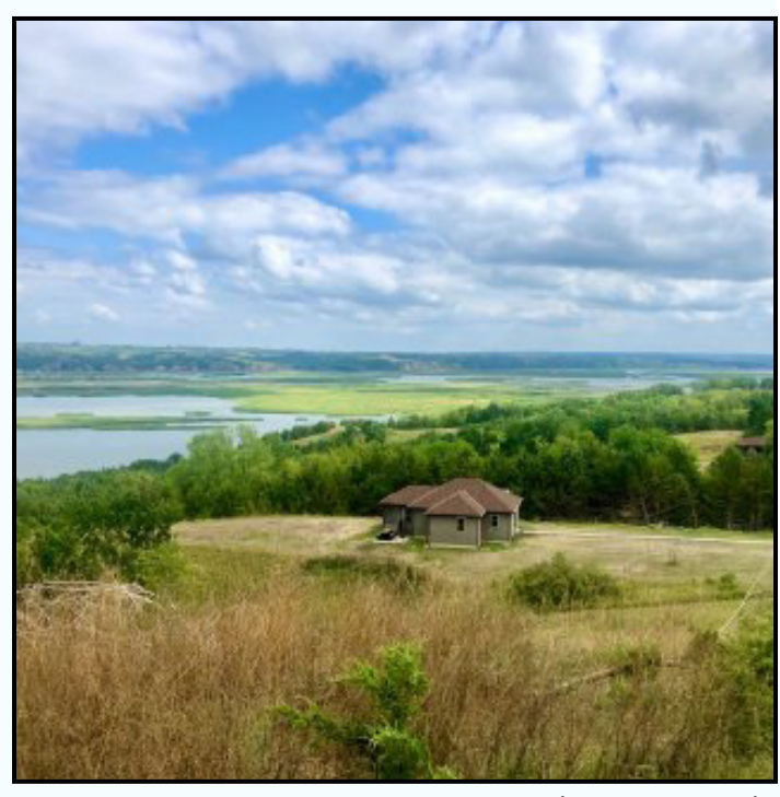
Niobrara State Park