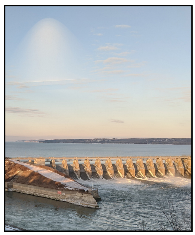
Gavins Point Dam

Nebraska Water Center & Central Nebraska Public Power and Irrigation District