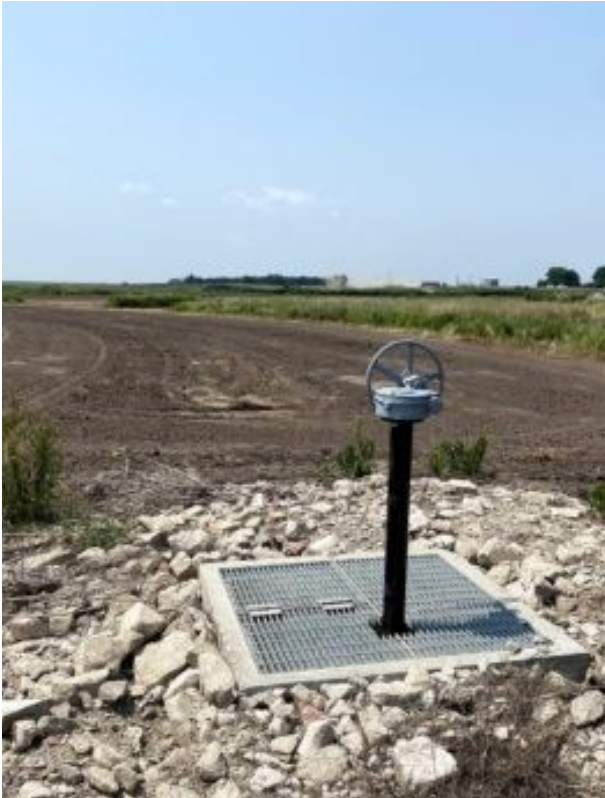
A water delivery point located at the Wildlife Protection Areas

Teaming up with Rainwater Basin partners Ducks Unlimited, Nebraska Department of Natural Resources, Tri-Basin Natural Resources District and U.S. Fish and Wildlife Service, Central has been a part of completing Phase I of the Western Basin Recharge Project.