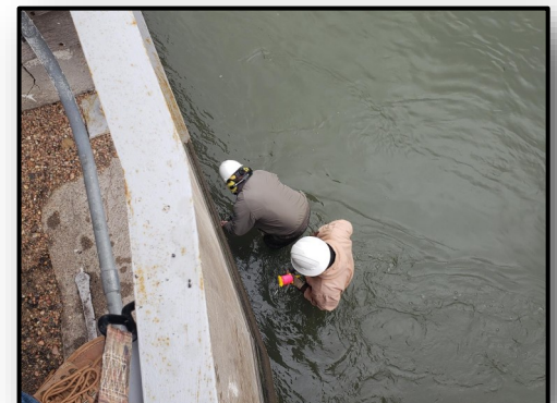
Below: Central employees work to replace the bottom seal on the Phelps Canal head gate