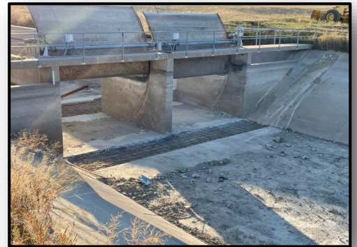
Above: Concrete work being done at 7.4 on Phelps Canal

These projects are needed to help maintain the reliability of the canal system.