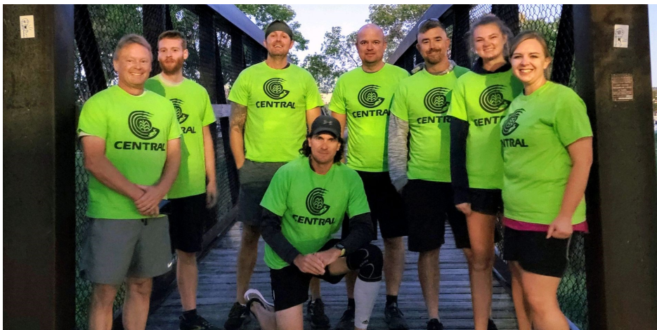
Several members of Central's staff participated in the Market to Market Relay running from Omaha to Lincoln. Central's team covered the 75-mile course in 12 hours.