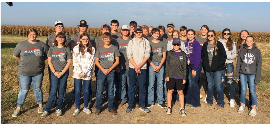
The CNPPID irrigation division provided meal tickets to more than 200 FFA students at several schools in the area that attended the 2021 Husker Harvest Days. Pictured is the Axtell FFA chapter.