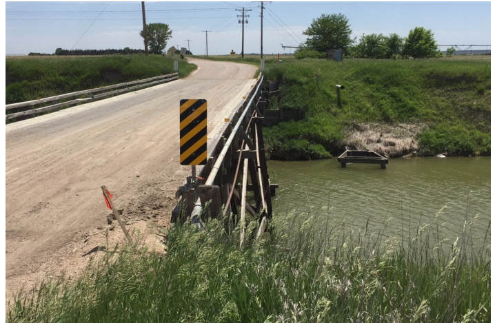
The Johnson Lake inlet bridge was closed due to safety reasons by Gosper County. Central signed an agreement to build a replacement bridge.

Central approved a contract with Oak Creek Engineering of Kearney to design the new inlet bridge that will be located at the same site as the existing bridge. Estimated cost of the project is $3 million. The engineering firm has started design of the project, and a construction timeline is dependent on contractors and availability of bridge materials. CNPPID