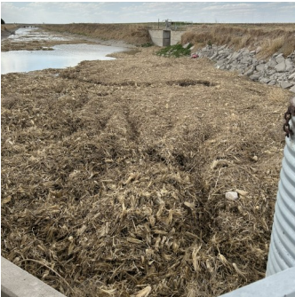
Irrigation staff battled debris piles that gathered like the photo above of a gate structure on the Phelps Canal north of Holdrege

In preparation for the upcoming 2026 growing season, Central's irrigation department faced many challenges during the offseason.