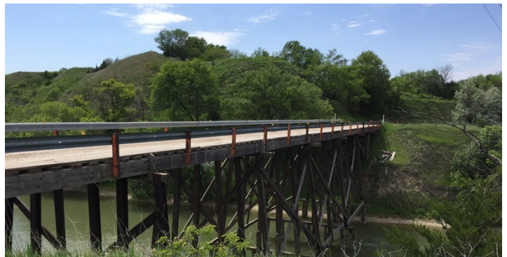
Bridges pictured above are the two timber bridges over the supply canal that will be closed by the county and removed by Central